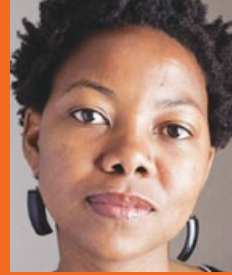
NoViolet Bulawayo (Zimbabwe)