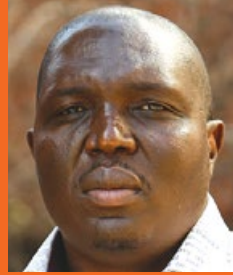
Mziikazi wa Afrika (South Africa)